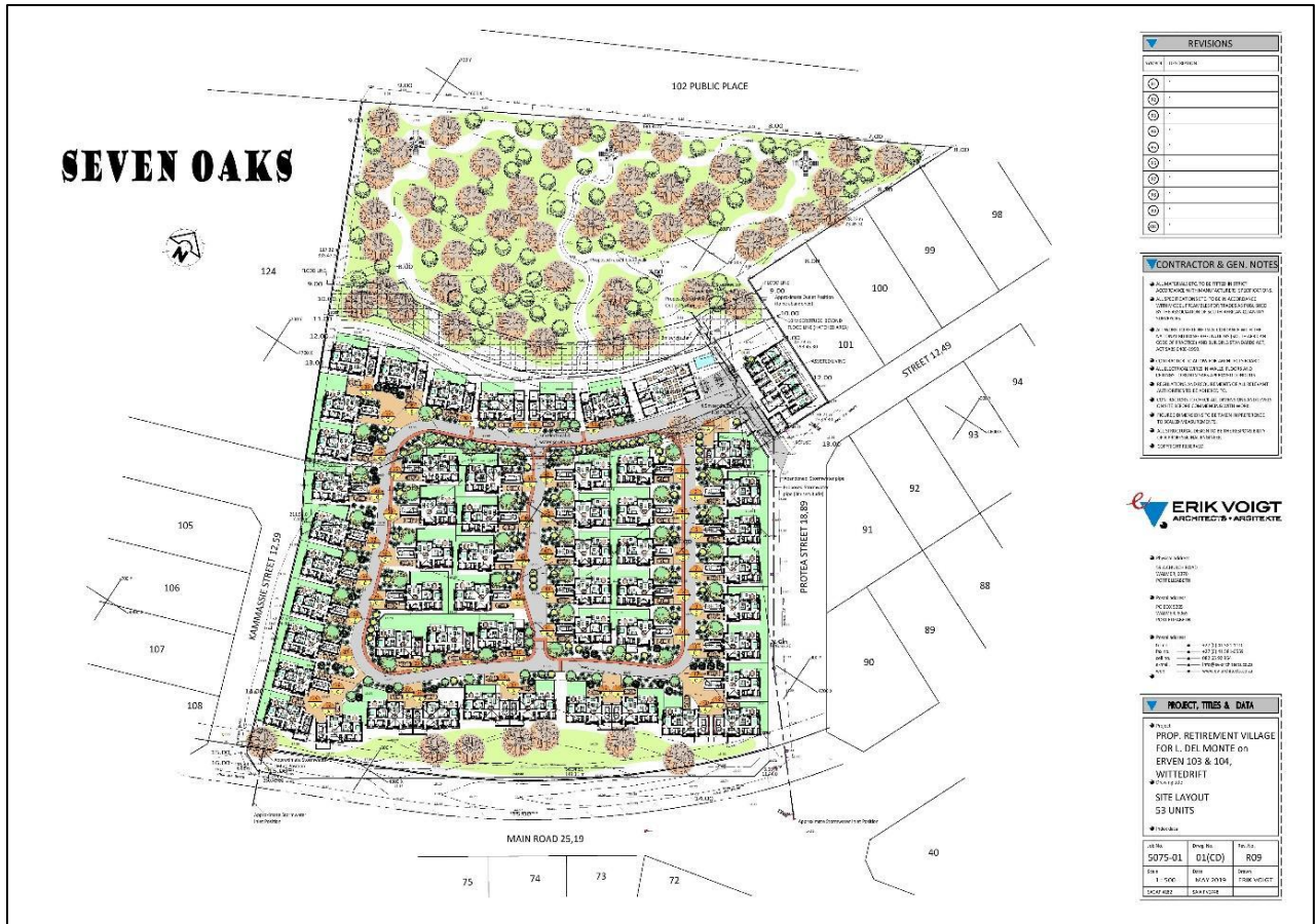
Figure 2: Proposed layout.