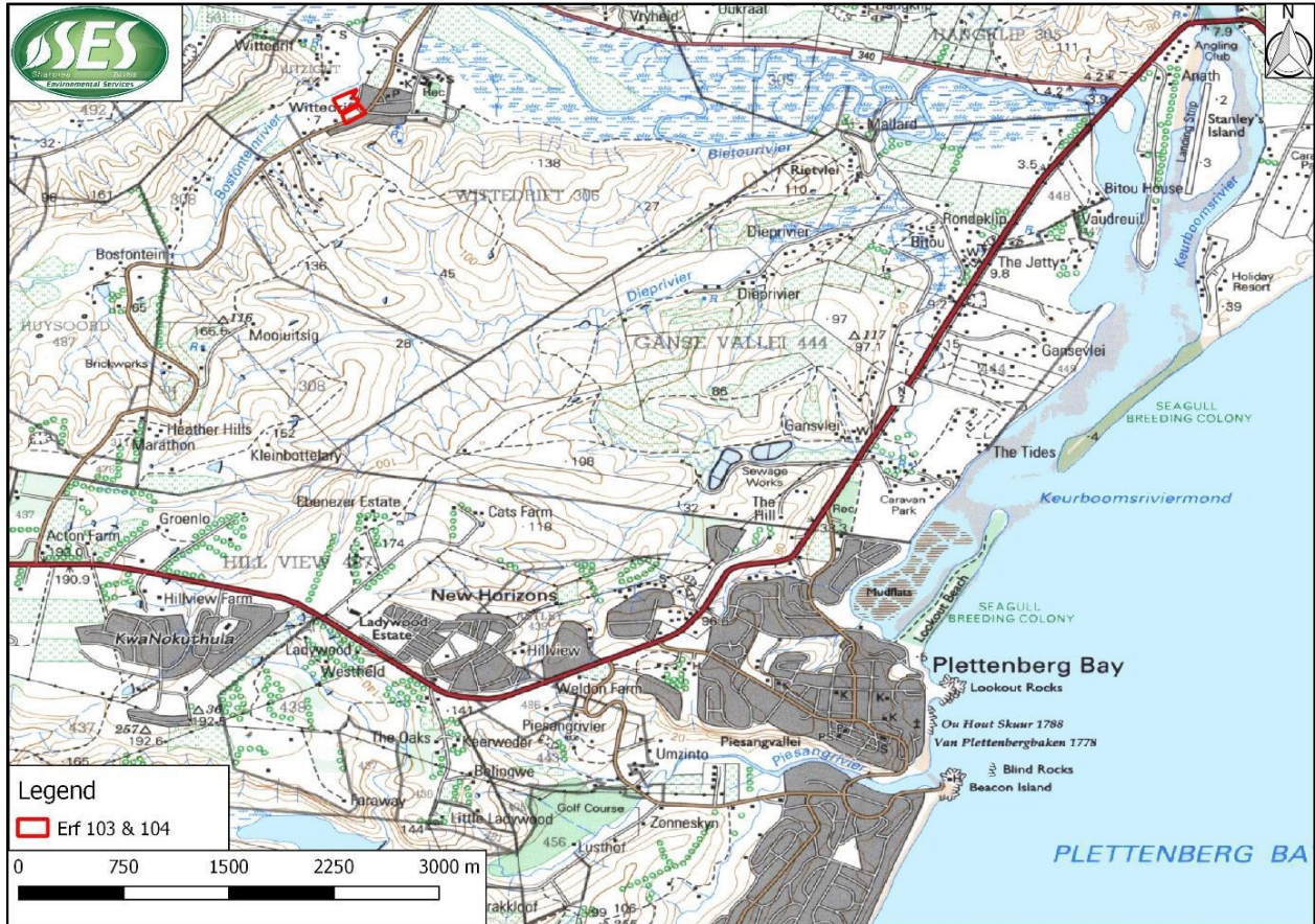
Figure 1: Locality of proposed development.

Sharples Environmental Services cc (SES) was appointed by The Home Market NPC as the independent Environmental Assessment Practitioner to conduct the Basic Assessment process for the proposed residential development (retirement village on Portion 103, 104 and a section Rotterdam Street, Wittedrift, Bitou Local Municipality.