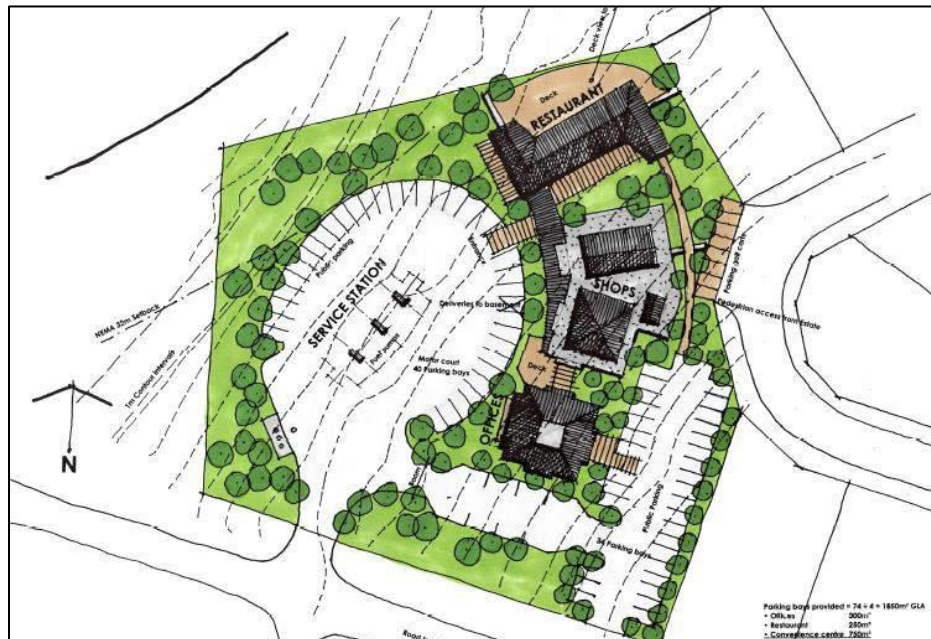
Figure 2: The Site Development Plan (SDP)

The Site Development Plan (SDP) of the commercial erf, as prepared by Brink Stokes Mkhize Architects, is shown below and is also included as addendum.