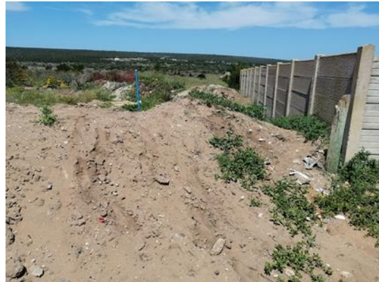
Image 9 and 10: Informal berms prohibiting access to the east of the site.