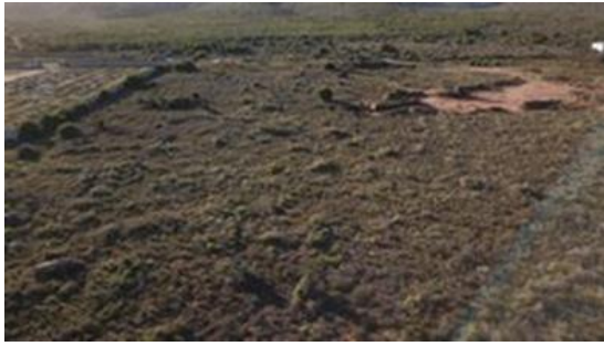
Image 7: Extent of disturbed Portion 141/480 east of existing site.