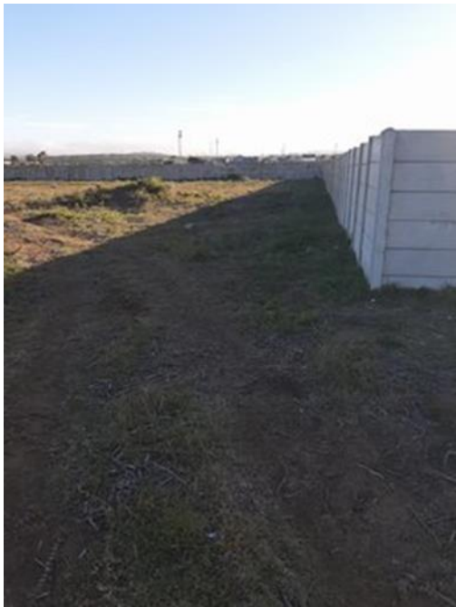
Image 3: Disturbed portions to the south of the existing cemetery.