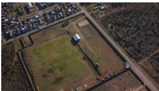
Image 11: Adjacent sports field and private properties to the west.