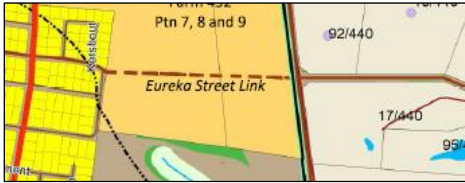
Figure 1 – Extract from Figure 57 of the Draft Bitou SDF (2018) that indicates the proposed future road link to the Kranshoek community.

The proposed road network included in the preferred layout (as indicated in Figure 2 below) is recommended to be strengthened in order to allow for this future link road to be established. This should ideally be a higher order road than the other neighbourhood roads indicated in the layout plan.