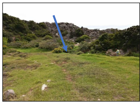
Figure L: Western stream.