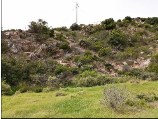
Figure M: View of hilltop from western stream.