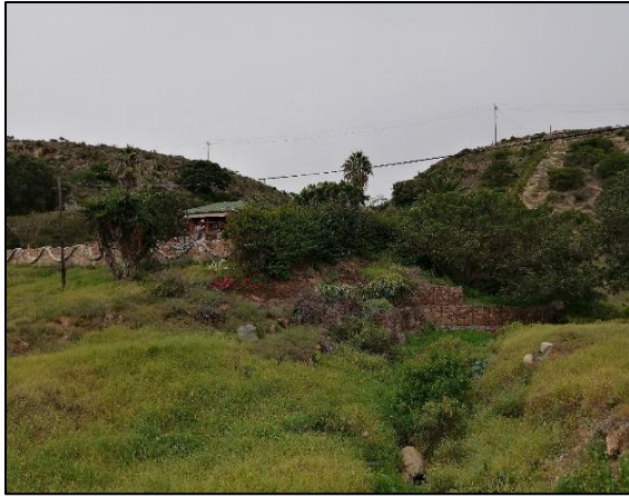
Figure A: Nearby house. (See map)