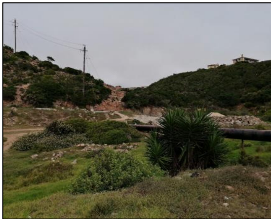
Figure E: Existing pipeline. (See map)