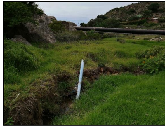
Figure F: Existing pipeline. (See map)