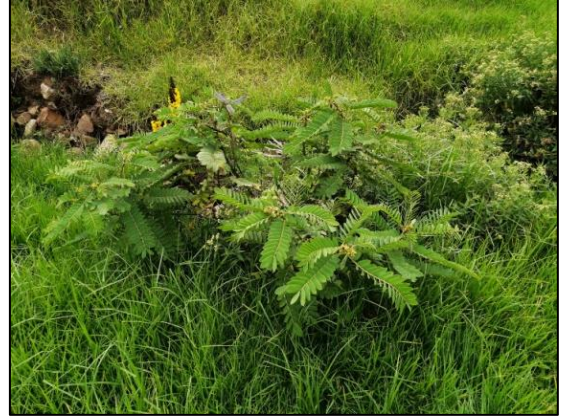
Figure N: On site vegetation