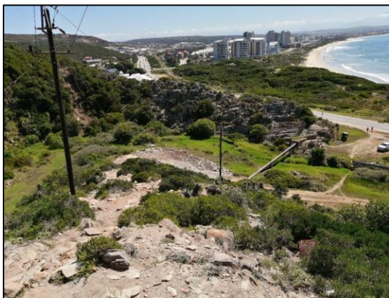
Figure I: View of pipeline from hilltop.