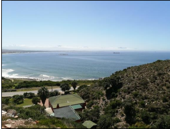
Figure G: View from hilltop.