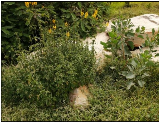
Figure O: On site vegetation