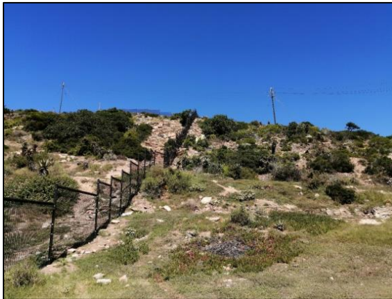
Figure C: Fence line bordering Erf4571 and Erf4350