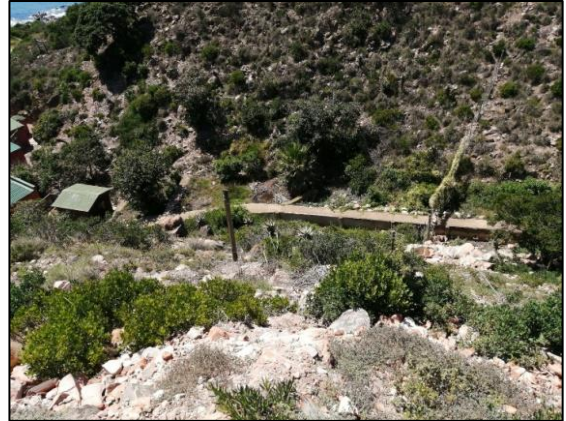
Figure H: View of valley and house from hilltop.