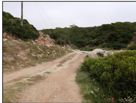
Figure D: Existing path leading up to hilltop. (See map)