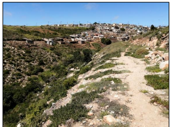
Figure J: View of Isazane informal housing.