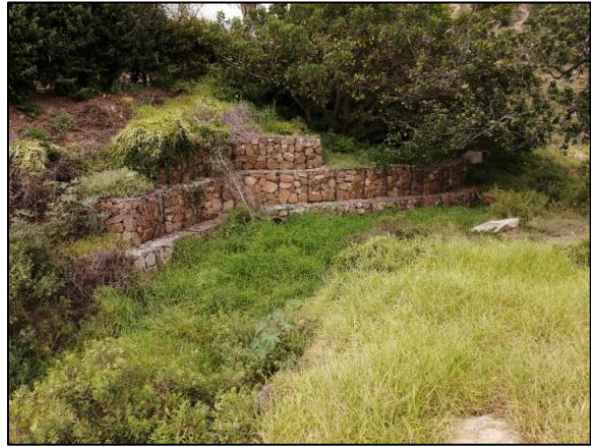
Figure B: Gabion below house. (See map)