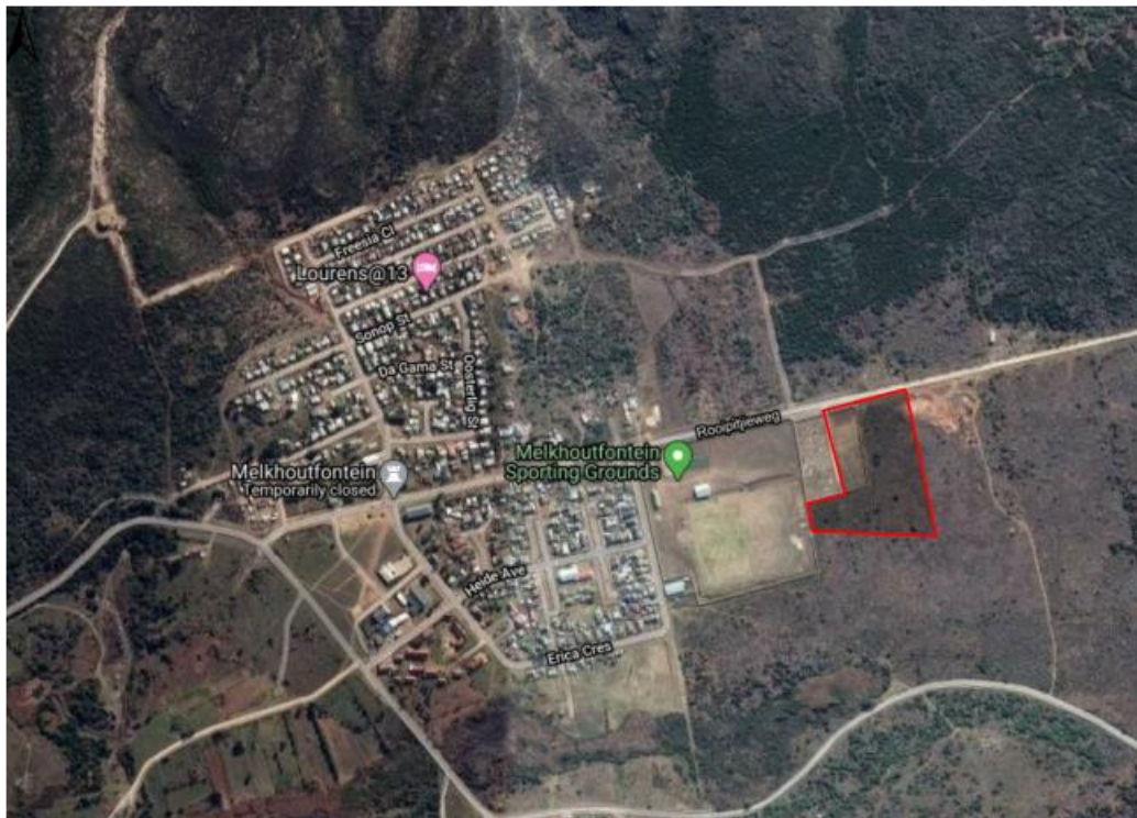
Figure 1 – Location of the area for expansion of the cemetery facilities at Melkhoutfontein near Still Bay, Hessequa Municipality, Western Province

The Hessequa Municipality is planning to expand the cemetery facilities at Melkhoutfontein near Still Bay in the Western Cape Province (Figure 1). The Municipality has engaged the services of Sharples Environmental Services to carry out an Environmental Scoping Study for the proposed project.