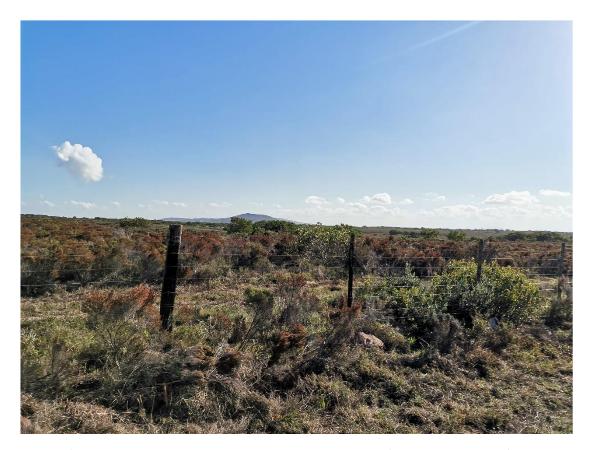
Figure 5: ERF 21275 from south-western corner of site, north-west facing.