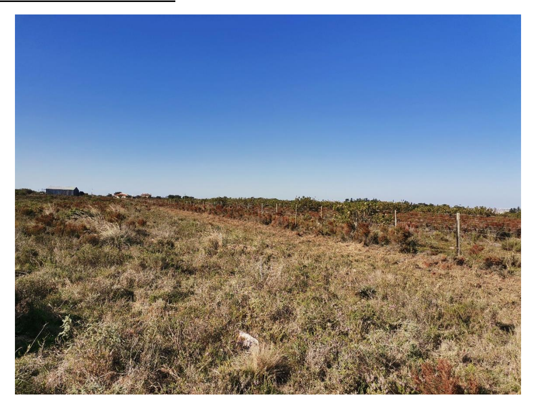
<u>Figure 1: ERF 21275 from south-western corner of site, facing south-east.</u>