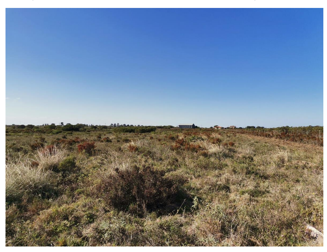
Figure 2: ERF 21275 from south-western corner of site, east facing.