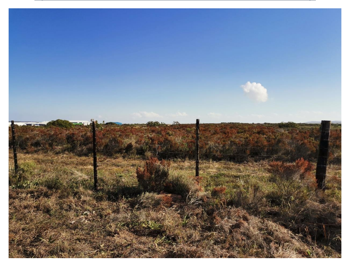
Figure 6: ERF 21275 from south-western corner of site, west facing.