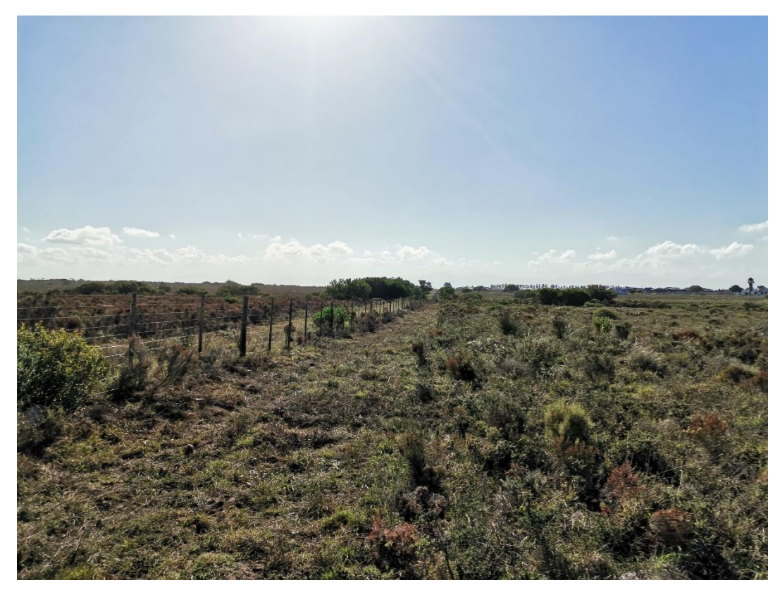
Figure 4: ERF 21275 from south-western corner of site, north facing.