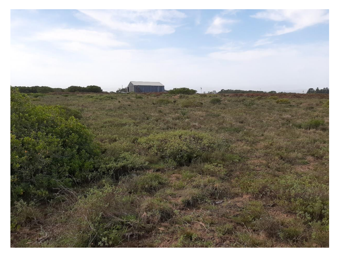
Figure 7: Existing Infrastructure on site.