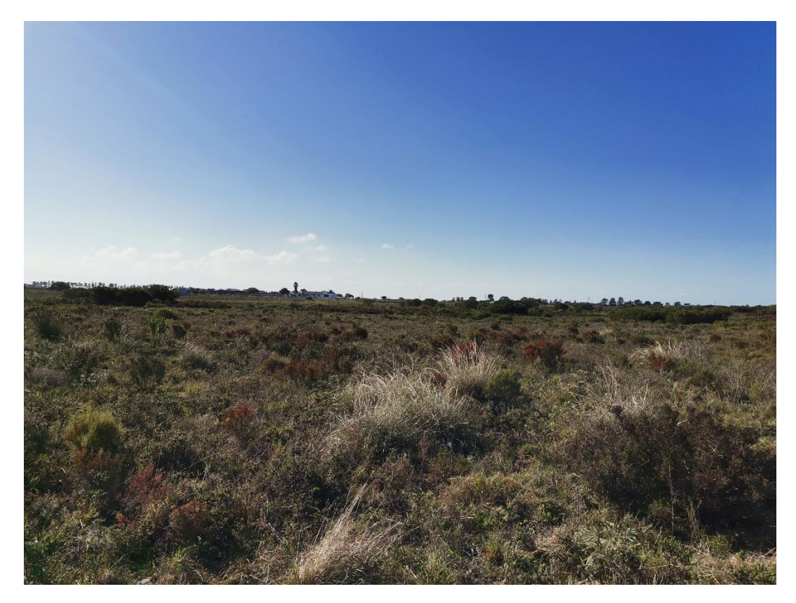
Figure 3: ERF 21275 from south-western corner of site, north-east facing.