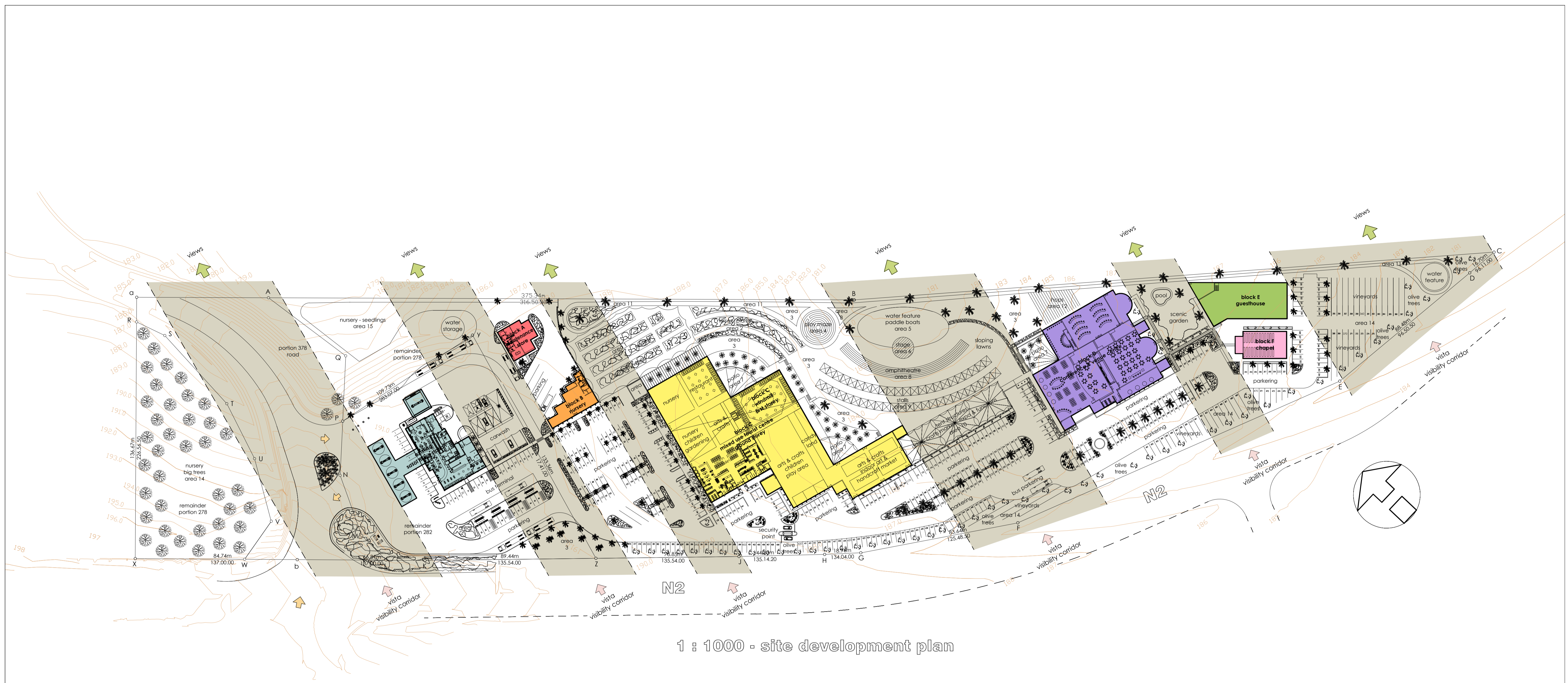
1 : 1000 - site development plan