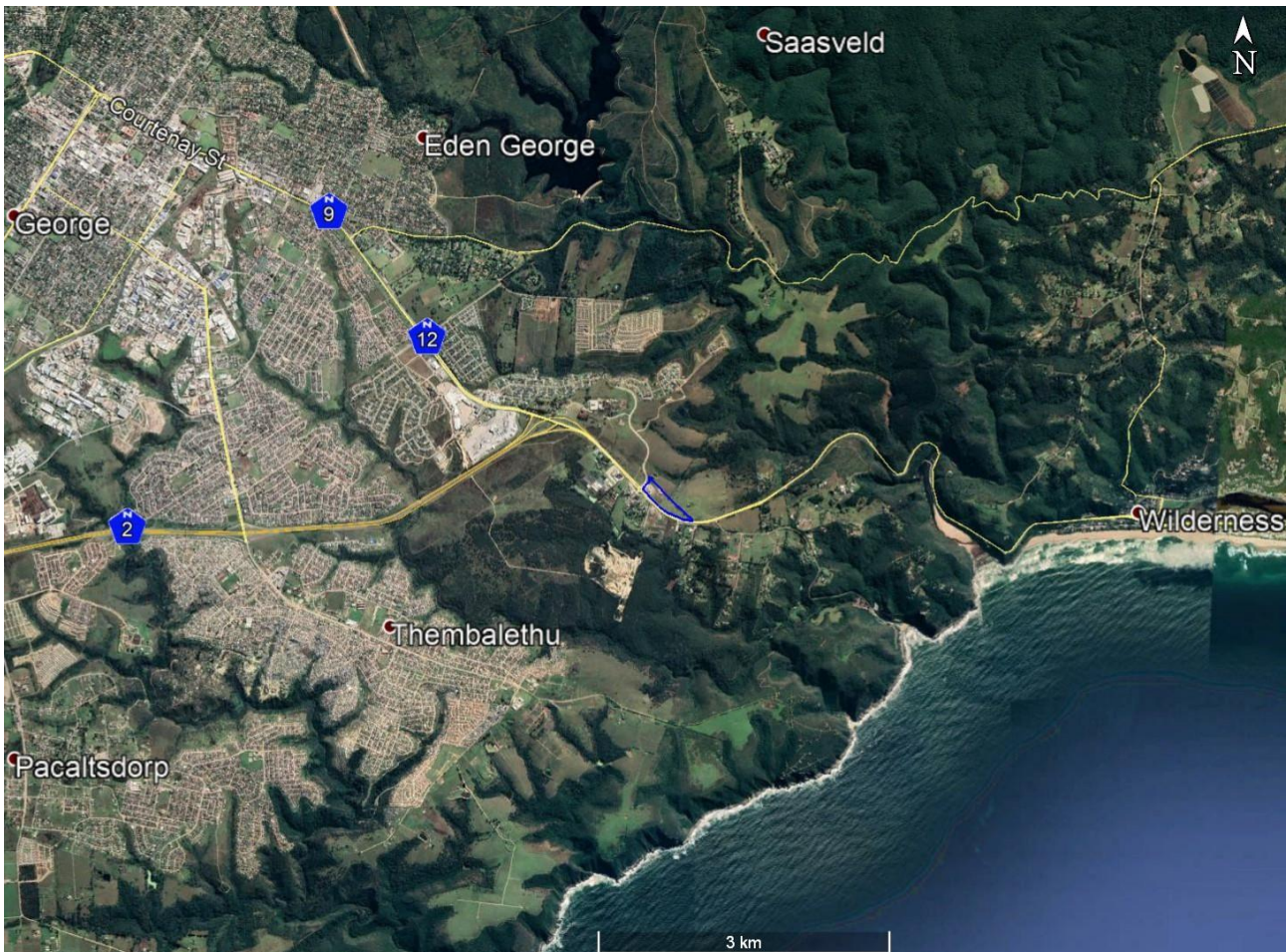
Figure 1. The locality of the proposed development (blue outline) on the N2 south east of George.

Environmental authorisation is being sought for a mixed use development on the above land parcel (see locality in Figure 1). In terms of the National Environmental Management Act (Act No 107 of 1998) (NEMA), an application for environmental authorisation requires an agricultural assessment.