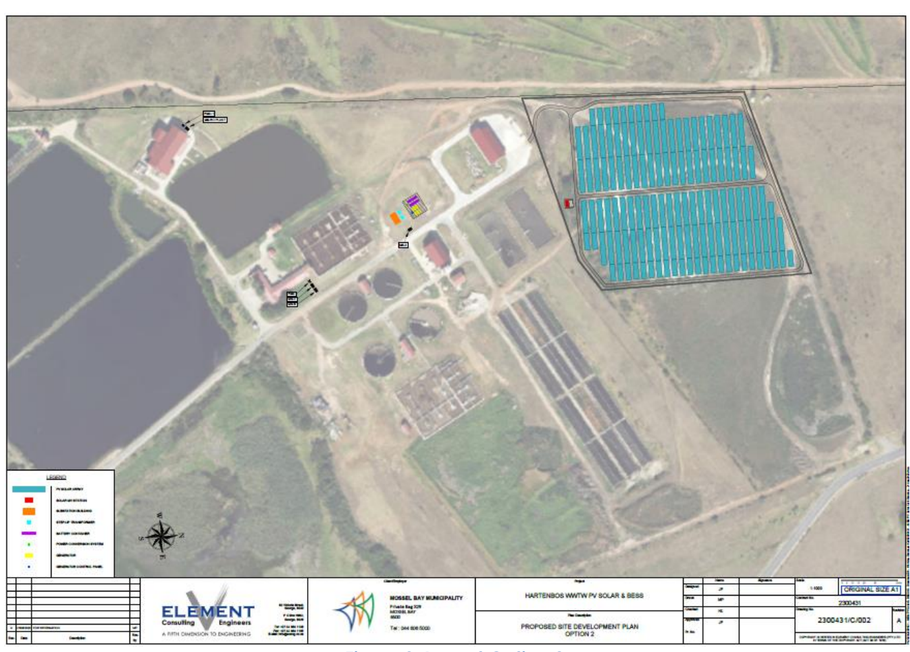
Figure 3: Layout Option 2.