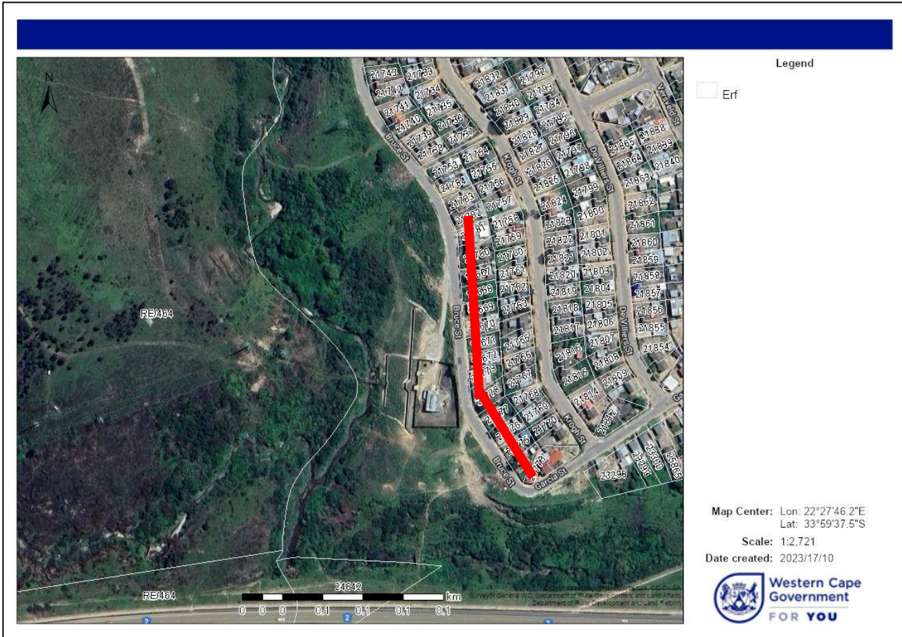
Figure 3: Proposed Automatically registered I&AP's