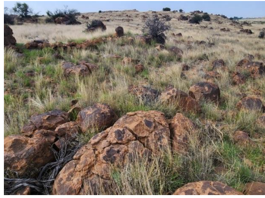
Figure 2. Photographic representation of the koppies/ridges/hills located within the study area.