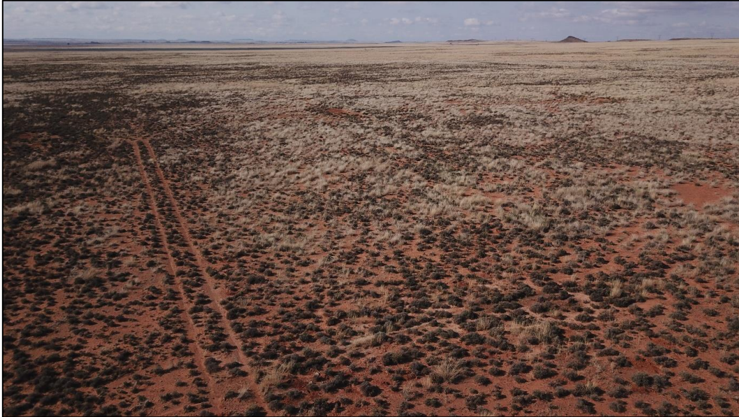
Figure 1. Drone footage of the degraded shrublands located within the study area.