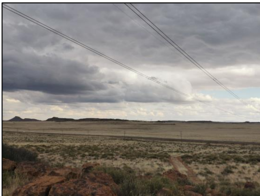
Figure 5. Photographic representation of the existing electricity infrastructure located within the site boundaries.