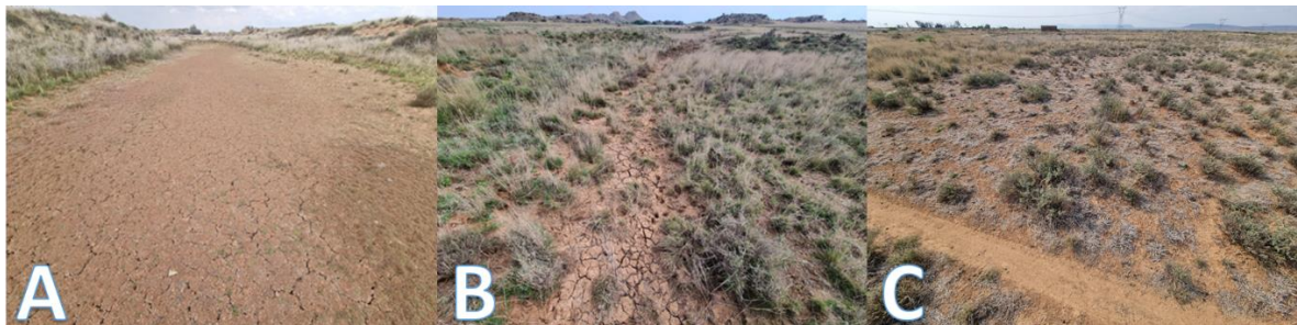
Figure 4. Photographic representation of the aquatic features located within the study area.