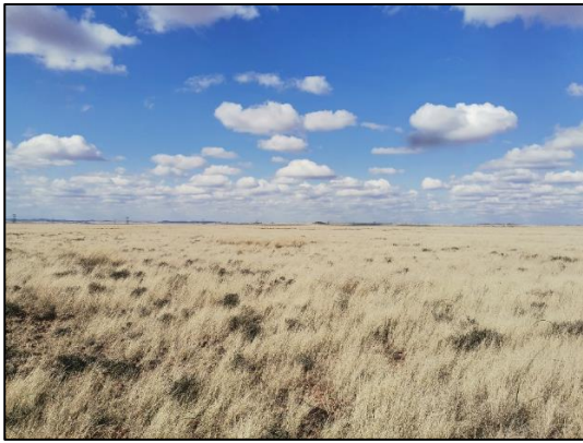
Figure 1. Photographic representation of the degraded shrublands located within the study area.