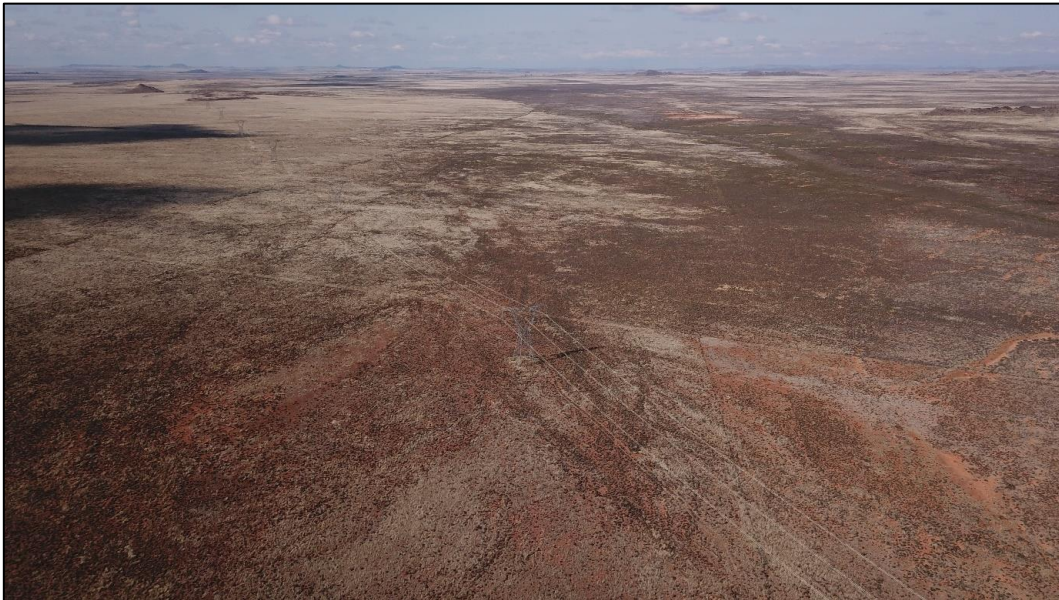
Figure 5. Photographic representation of the existing electricity infrastructure located within the site boundaries.