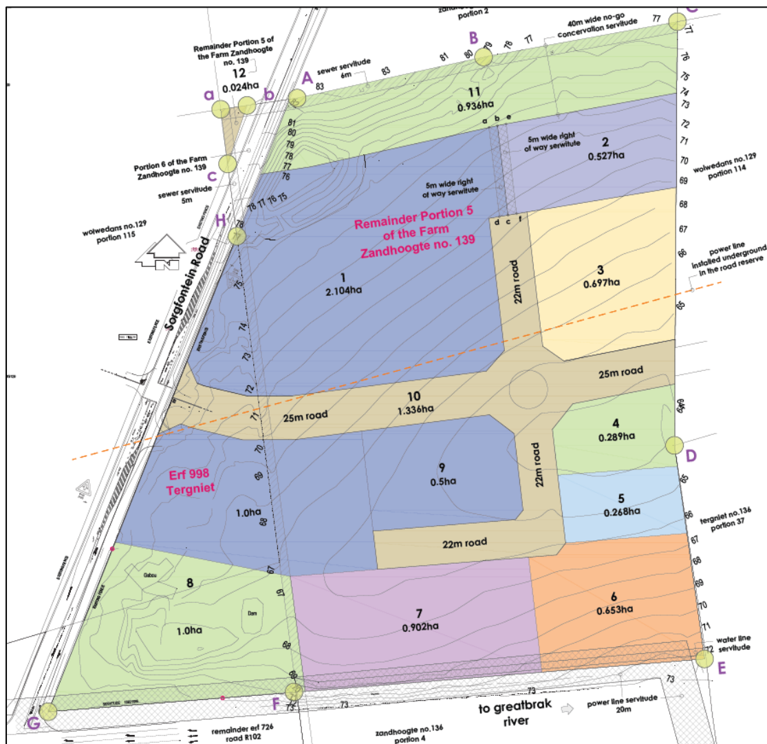
Figure 2: Proposed layout of the preferred alternative