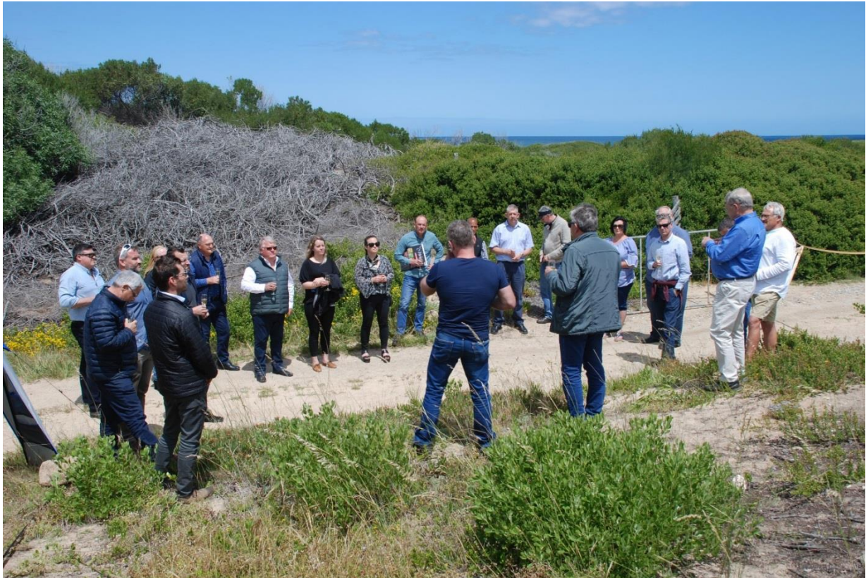
Photo 1: The site handover was held with the ASLA construction on 2 November 2021 at which the contractor was made aware of their environmental obligations.