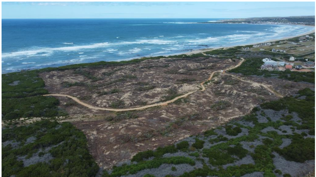
Photo 4: Cleared brushwood and mulch understorey have been put into windrows ready for chipping.