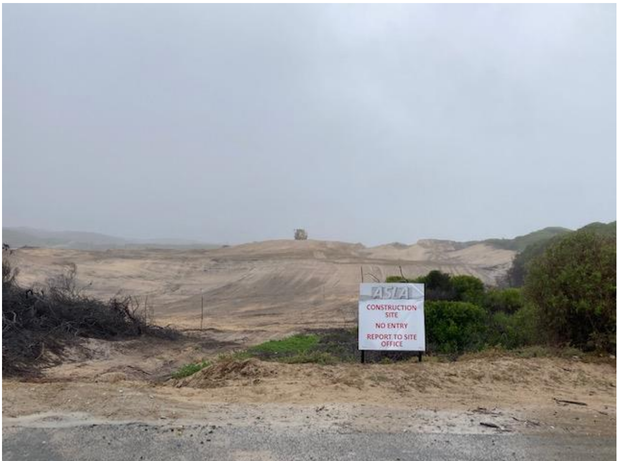
Photo 2: The notice board indicates that the public wishing to get to the Geelkrans Nature Reserve are to report to the site office (small container on site). The original board has been replaced with a larger sign board.