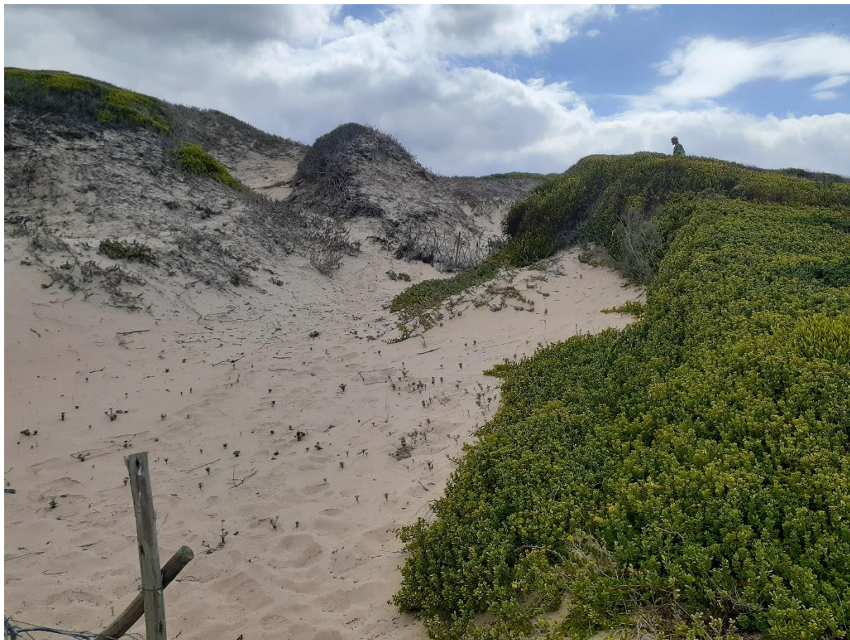
Photo 7: Shows the large blow-outs on the back dune area. Note the stable low angle of the backdune area.