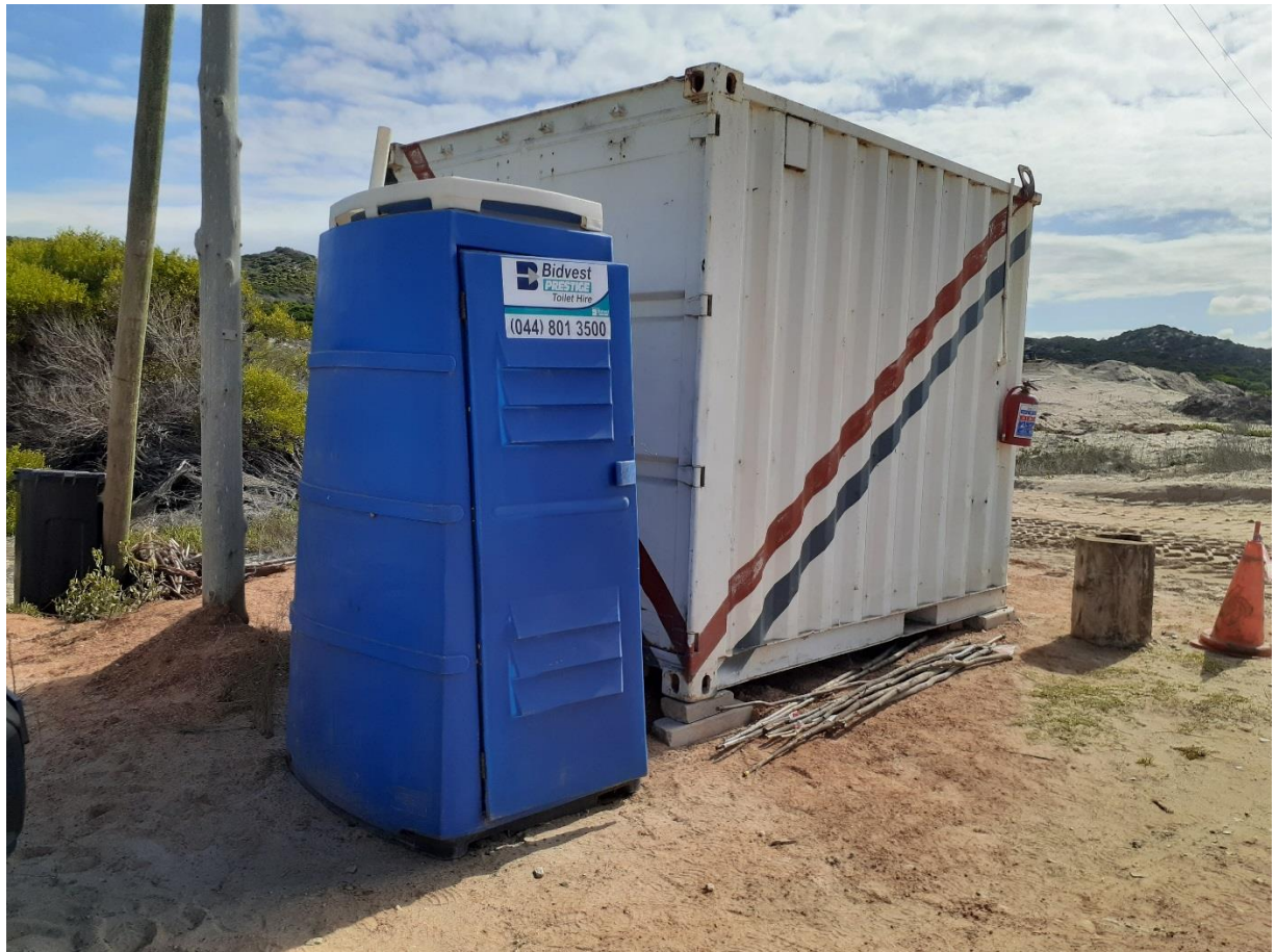
Photo 3: Temporary site office (container), mobile toilet and lidded dustbin are place on site within the out of work area.