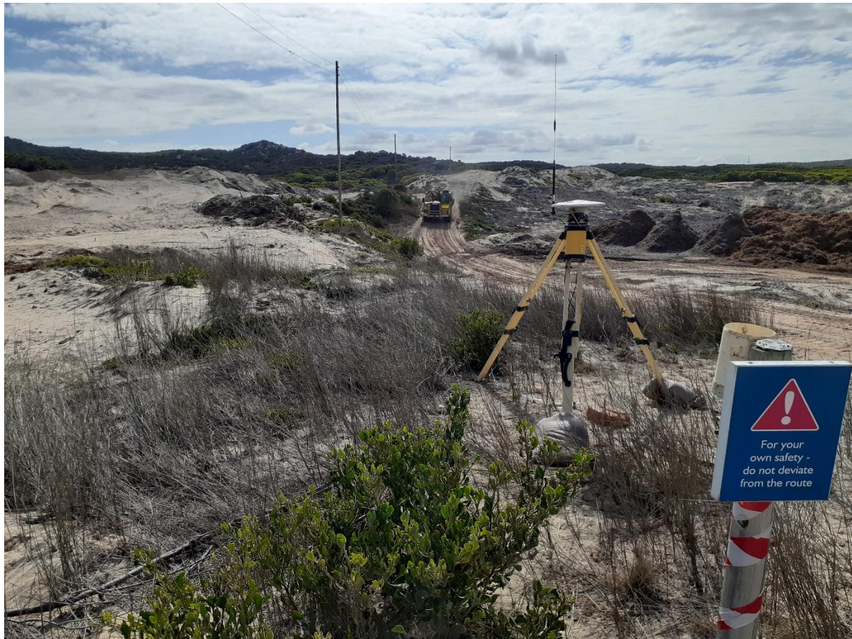
Photo 5: Wood chips heaps place on the de-grubbed site (top right corner of photo. Note the heavy scraper on the haul road.