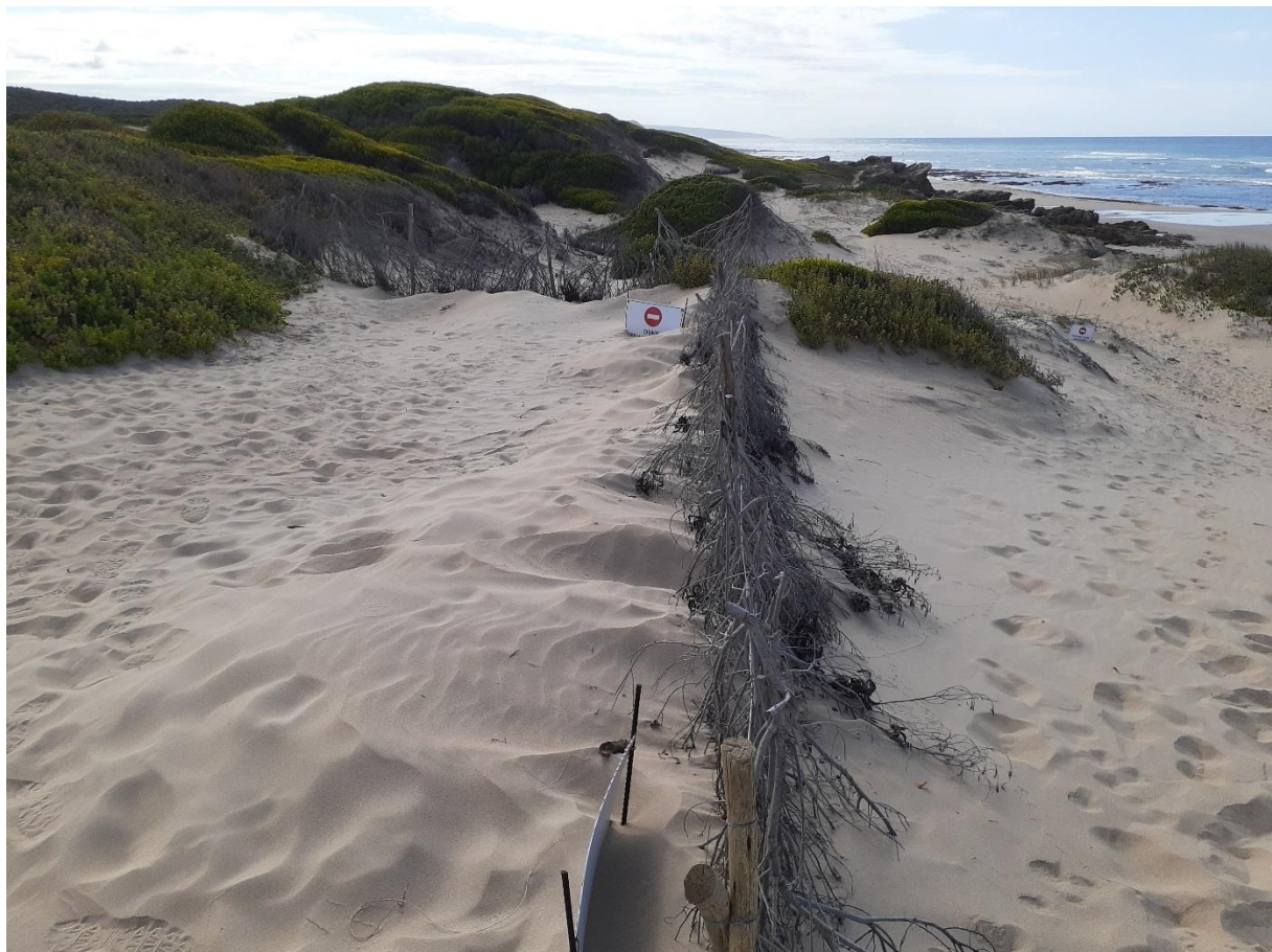
Photo 6: Example of a brushwood fences that have trapped windblow sand off the beach and frontal dune.