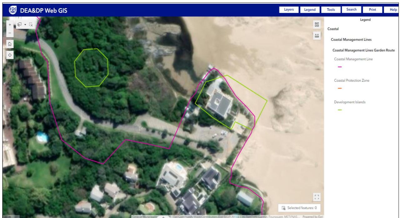
(Figure 1 depicting the proposed property in relation to the CML as well as the development island around Erf 10190)

2.1.7. Be advised that a development island is considered outside or landward of the CML in order to recognise existing development rights. In this regard, all the proposed activities within the boundaries of Erf 10190 falls within the development island and thus landward of the CML. Furthermore, all proposed activities directly south of Erf 10190 are also considered landward of the CML (see Figure 1 below). However, it must be noted that the development islands is to limit the enhancement of existing development rights and/or the expansion of development within these development islands in order to reduce risk of human life and properties as a result of coastal processes and impacts of climate change.