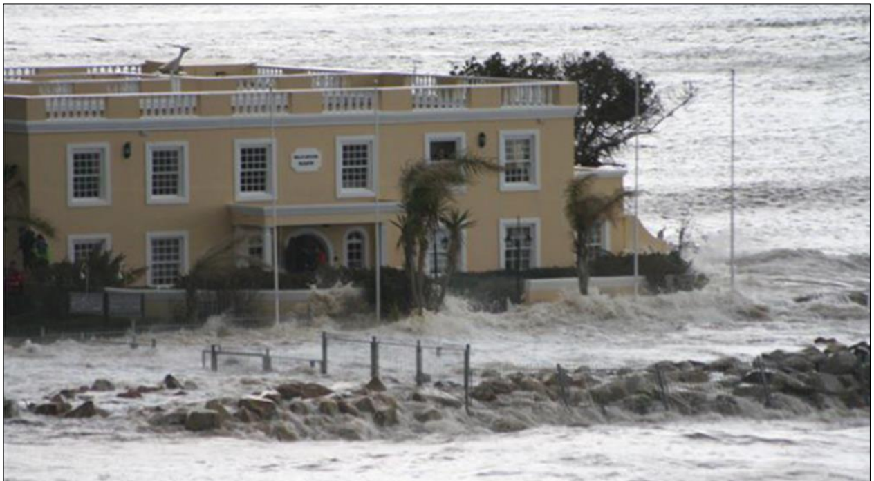
(Figure 2 showing the impact of the 2007 Storm event on the Milkwood Manor)

2.1.10. The proposal has also not been considered in the context of any Disaster Risk Management Plan on a municipal or district level. Due to the subject area's proximity to the coast and estuary it would be crucial to consider this information. Figure 3 below shows the extent of the impact of the 2007 Storm event on the subject area and it is clear that flooding and wave impact are issues of concern in this area along with a migrating estuary mouth and coastal processes. In this regard the applicant is advised to consider appropriate coastal buffers in their design proposal to address issues with potential coastal flooding and damages associated with sea-level rise.