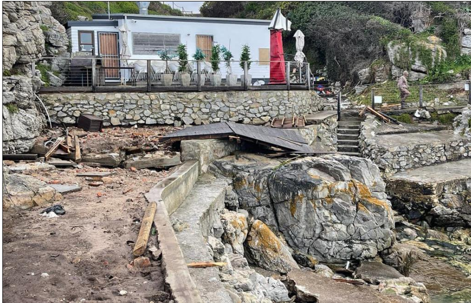
(Figure 2 depicting the damage of the September 2023 storm event with the wooden decks, furniture and balustrade completely destroyed)