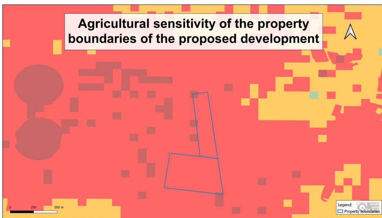
Figure 2. The assessed property (blue outline) overlaid on agricultural sensitivity, as given by the screening tool (green = low; yellow = medium; red = high; dark red = very high).

Note: There is an error in the screening tool whereby a land capability of 8 is classified as medium sensitivity, but according to NEMA's agricultural protocol, should in fact be classified as high sensitivity. This assessment follows the agricultural protocol definition and classifies a value of 8 as high sensitivity.