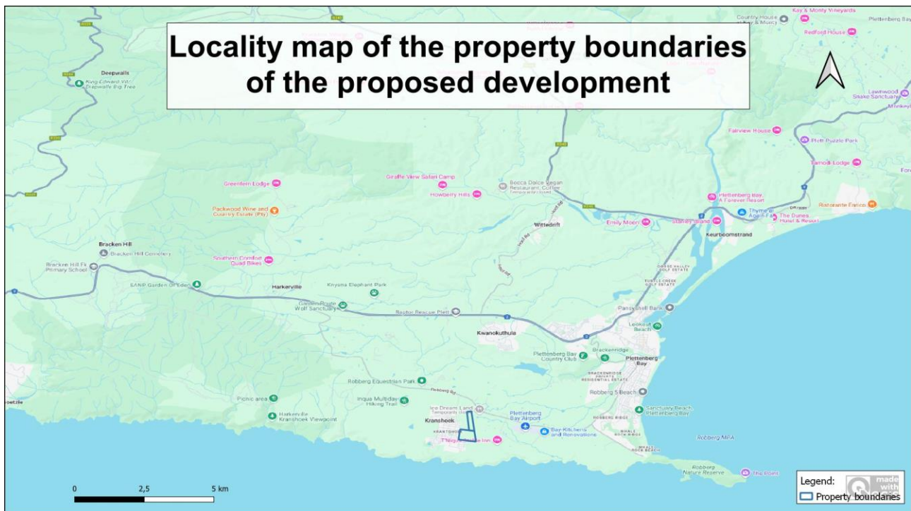
Figure 1. Locality map of the property boundary (blue outline), west of Plettenberg Bay.

Environmental and change of land use authorisation is being sought for the proposed mixed use development on portion 7 & 8 of farm 432 Krans Hoek, near Plettenberg Bay, Western Cape (see location in Figure 1). In terms of the National Environmental Management Act (Act No 107 of 1998 - NEMA), an application for environmental authorisation requires an agricultural assessment. In this case, based on the medium agricultural sensitivity of the assessed area (see Section 7), the level of agricultural assessment required by the protocol is an Agricultural Compliance Statement.