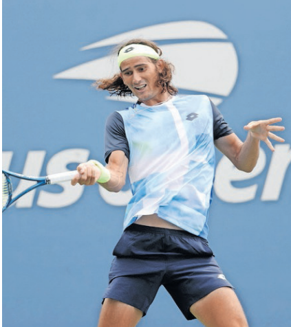
SA's Lloyd Harris beat 33rd seed Sebastian Baez 6-3, 7-5, 6-4 in Monday's opening round of the US Open to set up a clash against No 4 seed Taylor Fritz on Wednesday.