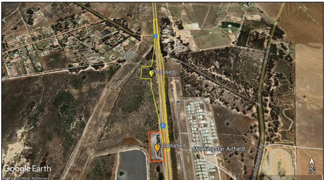
Figure 1: Locality Map.

A screening report was completed on the 3 rd of August 2023. With a “Very High” environmental sensitivity rating in terms of the Terrestrial Biodiversity Theme, and a “High” environmental sensitivity rating in terms of the Agriculture Theme, Animal Species Theme, Plant Species Theme and also Civil Aviation Theme. It is further