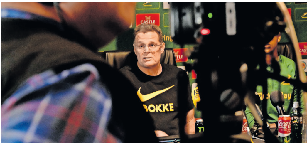
THE spotlight is on Rassie Erasmus' Springboks ahead of their match against the All Blacks at Eden Park.