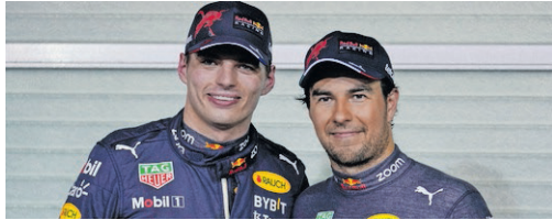
MAX Verstappen and Sergio Perez.

Alongside him comes Valtteri Bottas, the