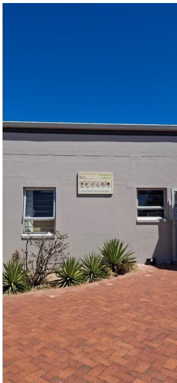
Figure 3. Tableview Library, 16/02/2026.