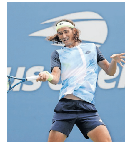
SA's Lloyd Harris beat 33rd seed Sebastian Baez 6-3, 7-5, 6-4 in Monday's opening round of the US Open to set up a clash against No 4 seed Taylor Fritz on Wednesday.