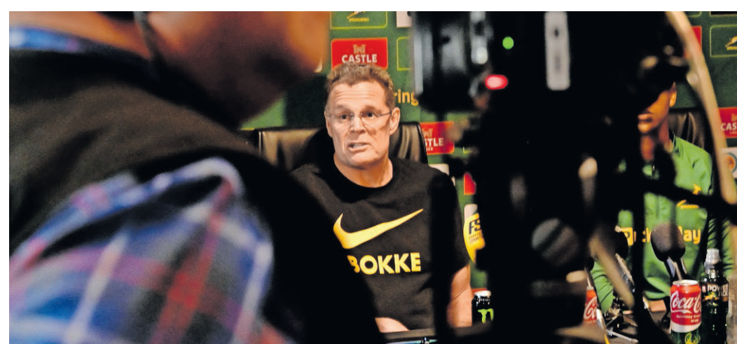
THE spotlight is on Rassie Erasmus' Springboks ahead of their match against the All Blacks at Eden Park.