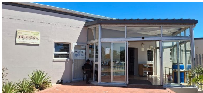
Figure 4. Tableview Library, entrance, 16/02/2026.