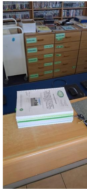
Figure 2. Revised BAR distributed at the Table View, Library, Table View, 16/02/2026.