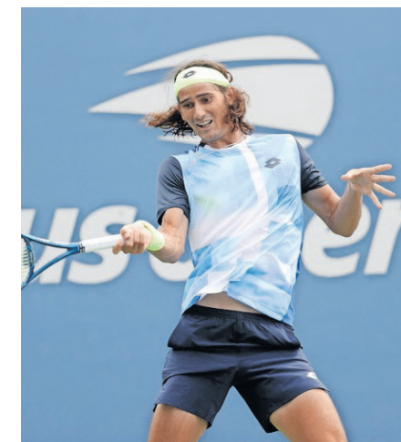
SA's Lloyd Harris beat 33rd seed Sebastian Baez 6-3, 7-5, 6-4 in Monday's opening round of the US Open to set up a clash against No 4 seed Taylor Fritz on Wednesday.