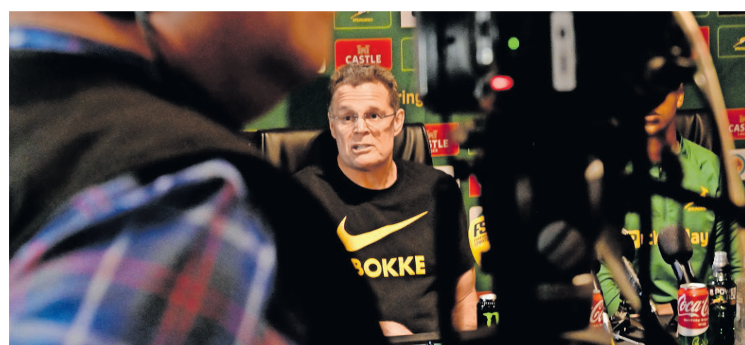
THE spotlight is on Rassie Erasmus' Springboks ahead of their match against the All Blacks at Eden Park.