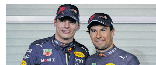
MAX Verstappen and Sergio Perez.

Alongside him comes Valtteri Bottas, the