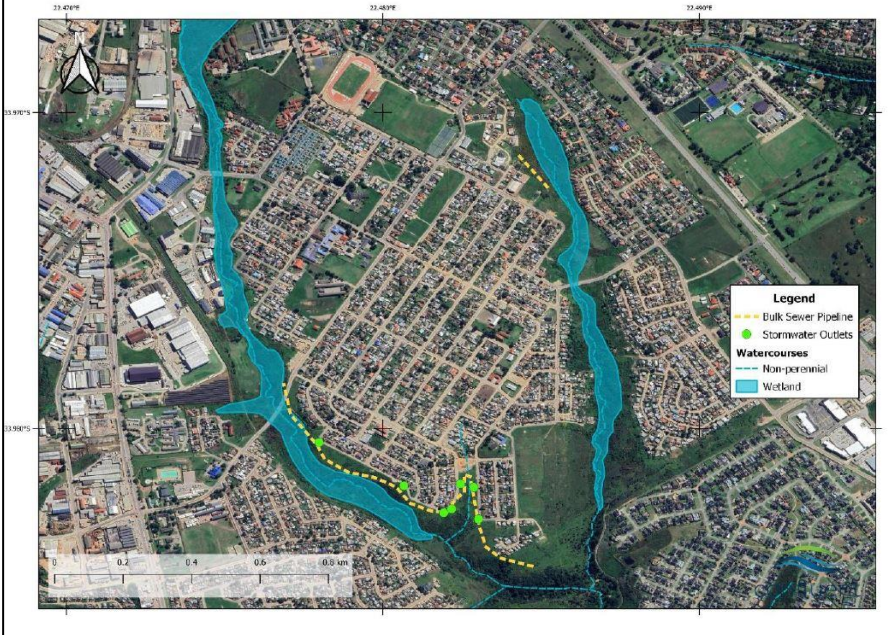
APPENDIX B2: FIGURE 1: MAP SHOWING THE DELINEATED EXTENT OF SEEP WETLANDS ALONG THE MEUL RIVER AND ITS EASTERN TRIBUTARY.